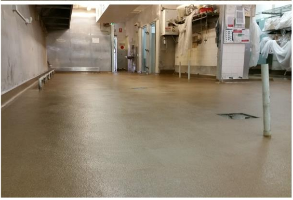
*The transformation of a severely damaged kitchen

For further technical information, or information on our services, please contact our office on (02) 9674 7457